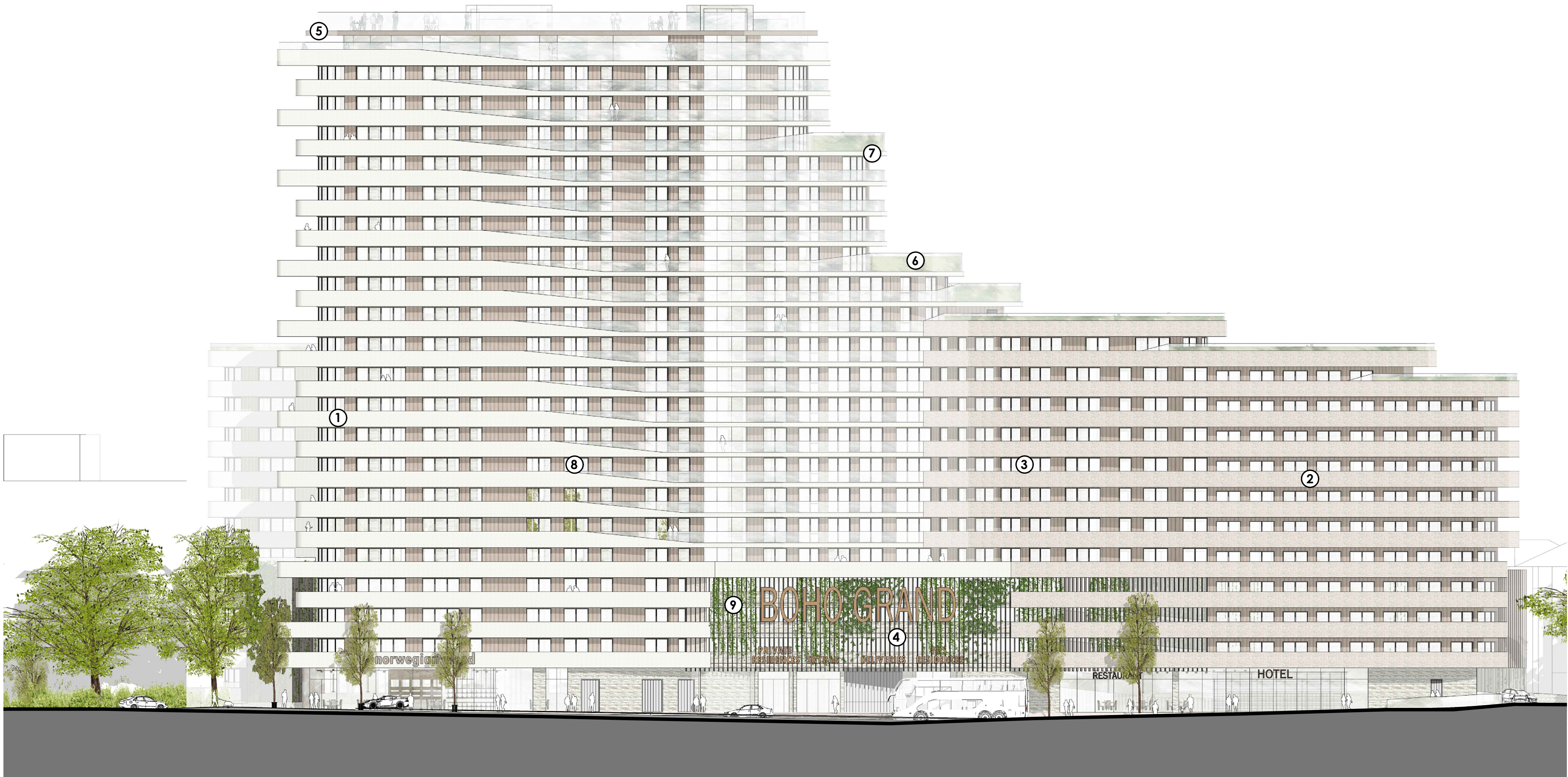
PROPOSED SOUTH EAST ELEVATION SCALE 1:250