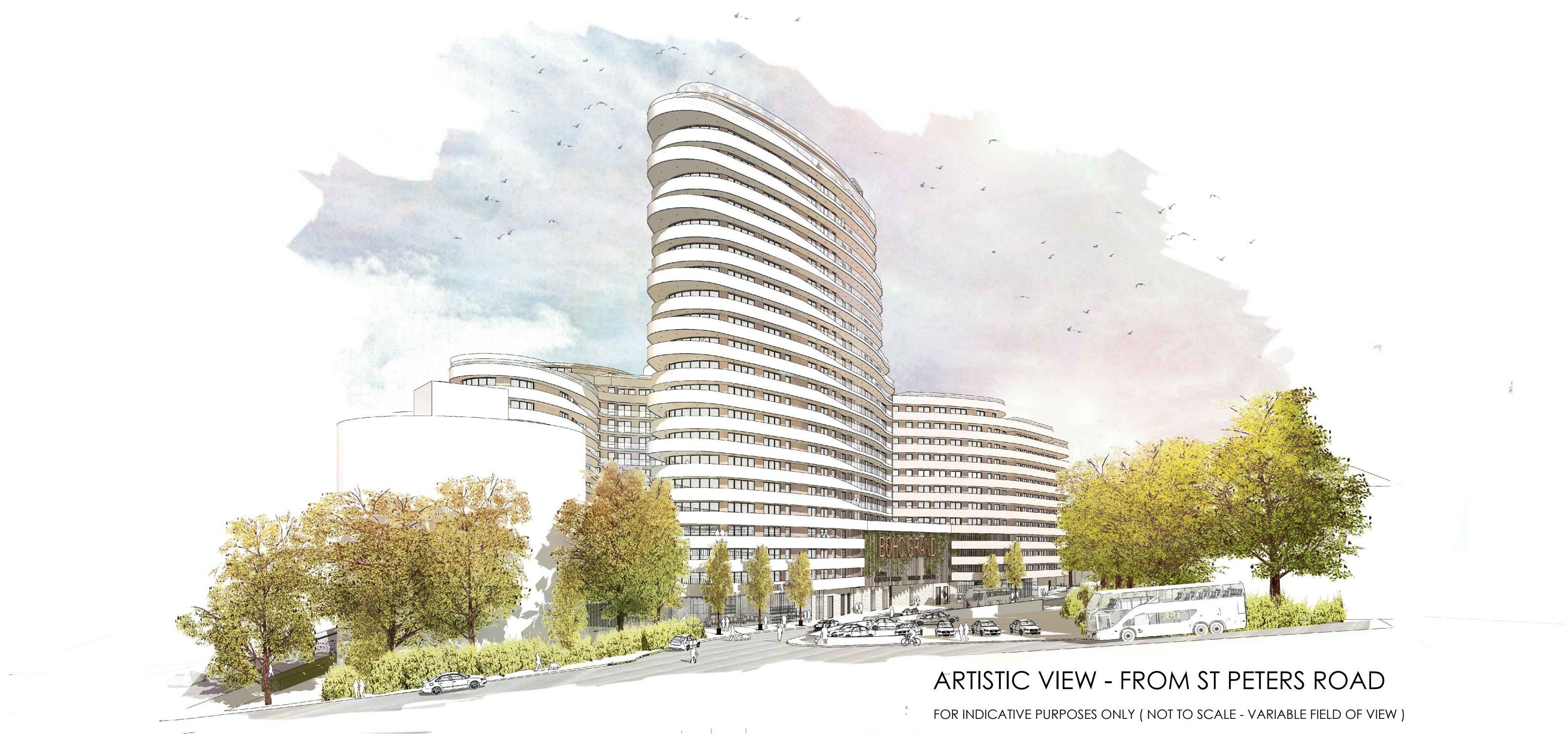
ARTISTIC VIEW - FROM ST PETERS ROAD

FOR INDICATIVE PURPOSES ONLY ( NOT TO SCALE - VARIABLE FIELD OF VIEW )