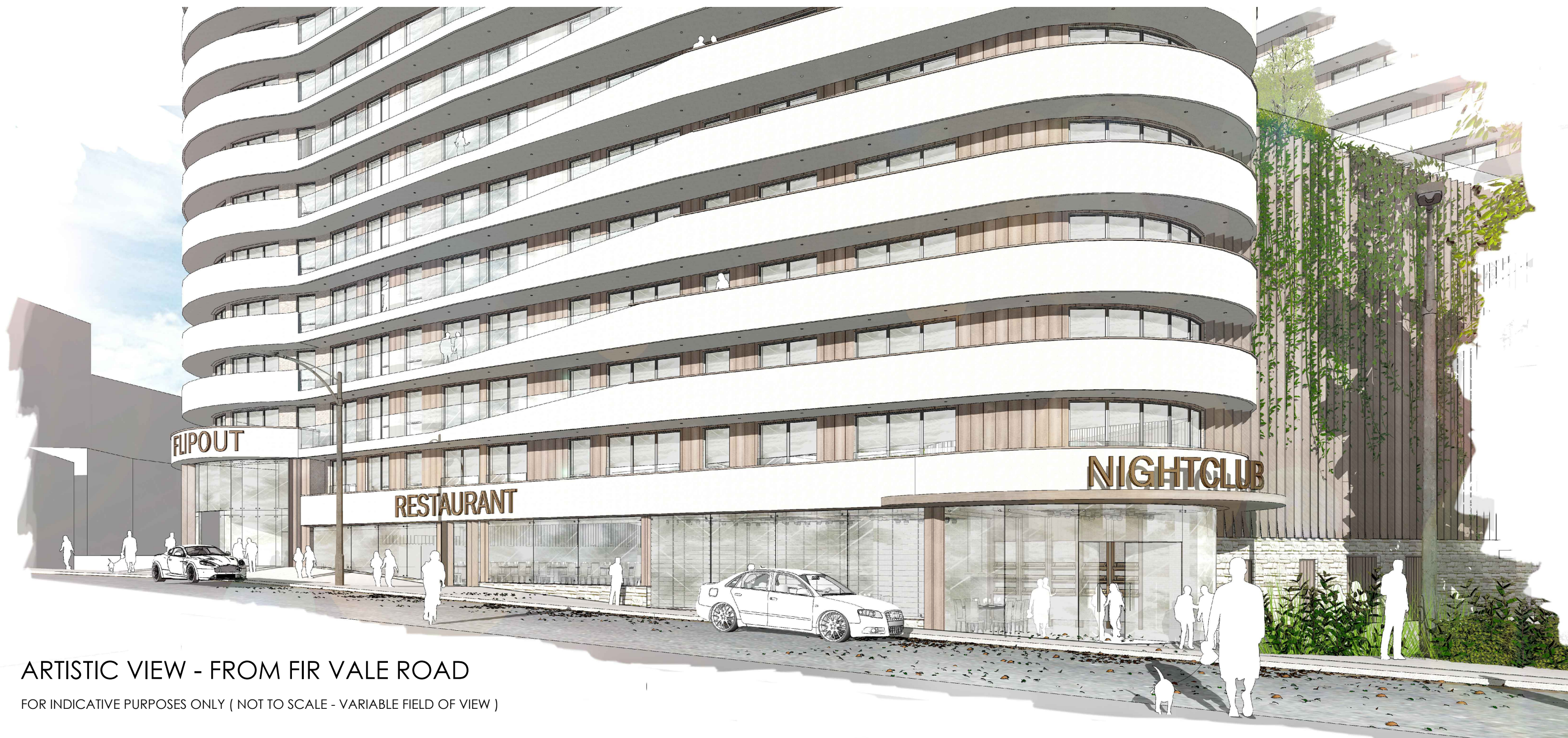
ARTISTIC VIEW - FROM FIR VALE ROAD FOR INDICATIVE PURPOSES ONLY ( NOT TO SCALE - VARIABLE FIELD OF VIEW )