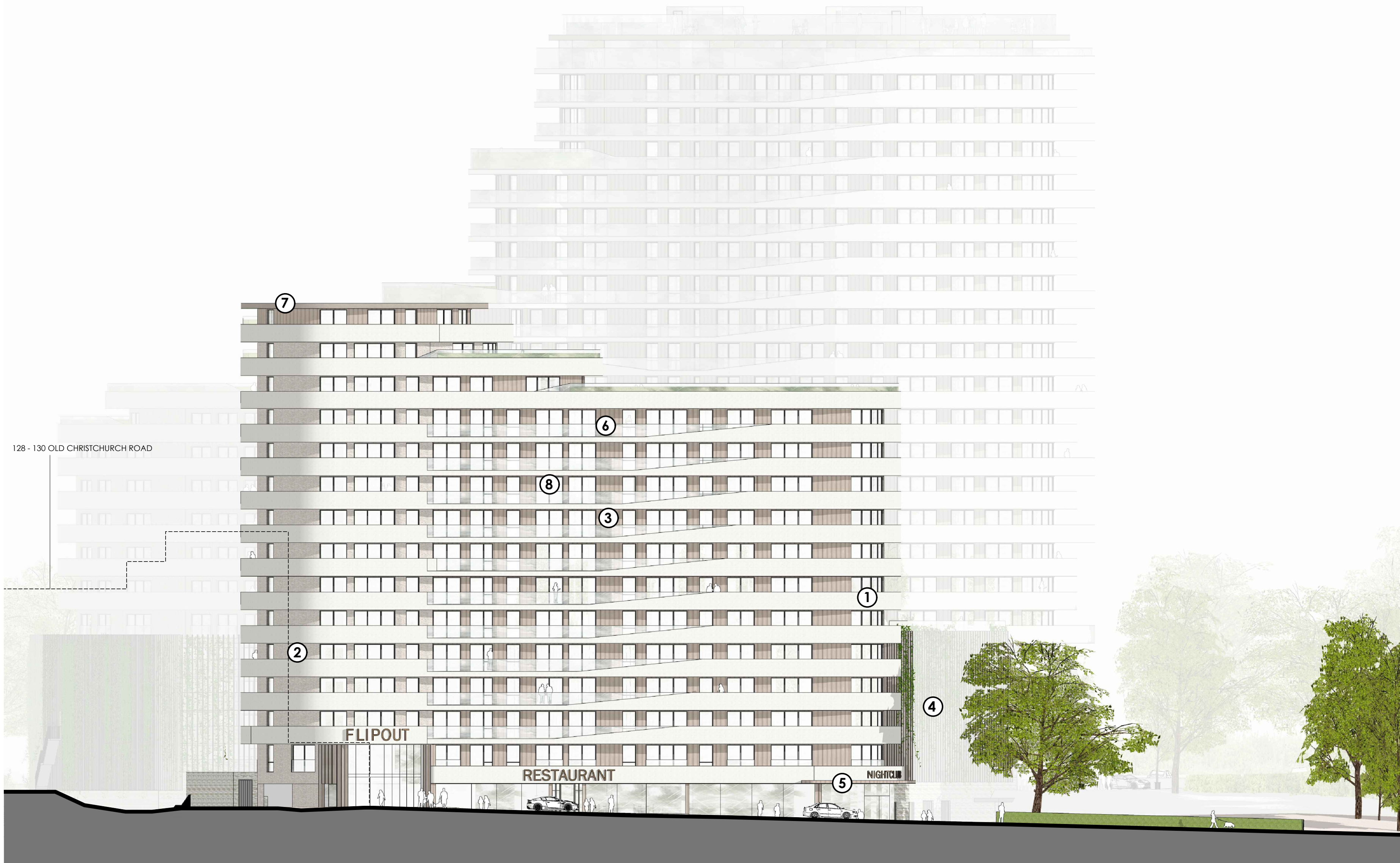
PROPOSED NORTH WEST ELEVATION SCALE 1:250